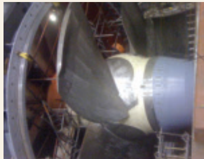
Prop at a hydro-electric maintenance outage at Weber Falls

P.S. Our web site address is southernstatesmillwrights.org Go online to access a whole host of information about jobs, training, and current news and events.