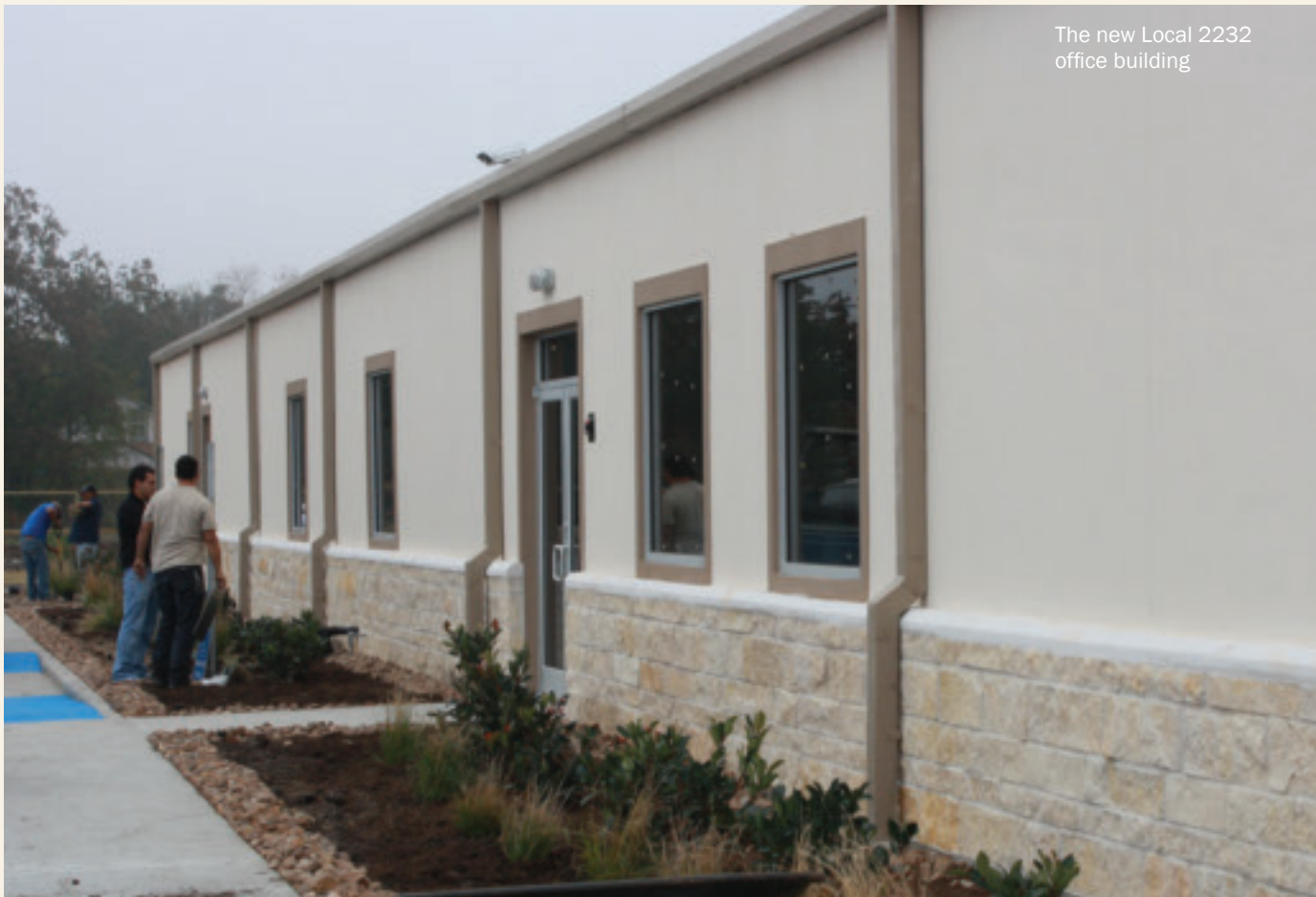
The new Local 2232 office building

The body voted in 2008 to purchase land and build the new hall, which we then started in 2010. As with any new construction project, building our new hall had some complications at first. Our main issue was with the contractor, so we had to change the general contractor, which is now Way-Tec (signatory to Carpenters Local 551). We then restarted the project in June 2011. The 7,500 square feet building will be set on approximately 1.25 acres with some rental space available in the building. The hall projected opening date was December 2011 and we are proud to say it is completely Union built.