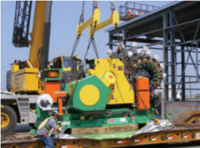
At the Ball Corporation project in Ft. Worth, members used an 8-color decorator weighing 56,000 pounds

As a 32-year member going on into my 15th year as a millwright representative, I have been asked on several occasions "What can I do as a member to support my local union?" My initial response is this: By building and then protecting your reputation as a dependable, highly skilled, trained, and professional millwright, you will also protect and build the reputation of the local union. Often, that answer provokes the question, "How does my reputation affect the local union?" All Millwrights young and old have heard the old adage "The three ways of getting word out is 'telephone, telegraph, tell a MILLWRIGHT!'" This is referred to as the Millwright Grapevine.