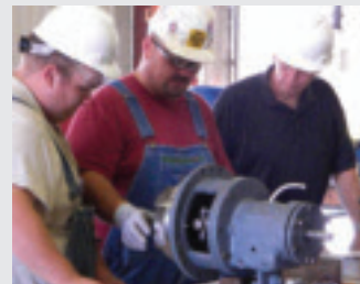
Flowserve training at the Russellville, AR Training Center

We are in the process of ongoing training with the following classes: Power Transmission, Pump & Motor Alignment, Rigging, GE Familiarization and Hytorc, Bearing, and Human Performance. We have started teaching Flow Serve this year and our first class was very successful.