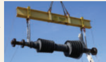
Turbine from Plant Wilson, a coal-fired power house in Gulfport, MS

With that said, I would like to address some of the employment opportunities that I see in the near future for millwrights in Local 1192's area. Grand Gulf Nuclear Station is ramping up for the largest outage ever attempted in the nuclear industry of our nation. It is scheduled for February of 2012, with man power needs of almost 200 millwrights. We have several members already on site preforming pre-outage work in order to accomplish the task at hand. We also have a sizeable outage at Browns Ferry Nuclear Station that will begin ramping up any time now. This outage is scheduled to kick off in early April.