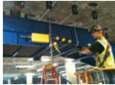
Inside the Dallas Fort Worth airport project

By building a reputation as a highly skilled, professional, dependable millwright, you will build a good reputation for both yourself and the local union. I have had many contractors tell